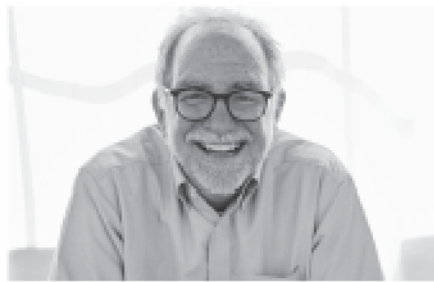
Bob Goff New York Times Best Selling Author