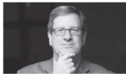
Lee Strobel New York Times Best Selling Author